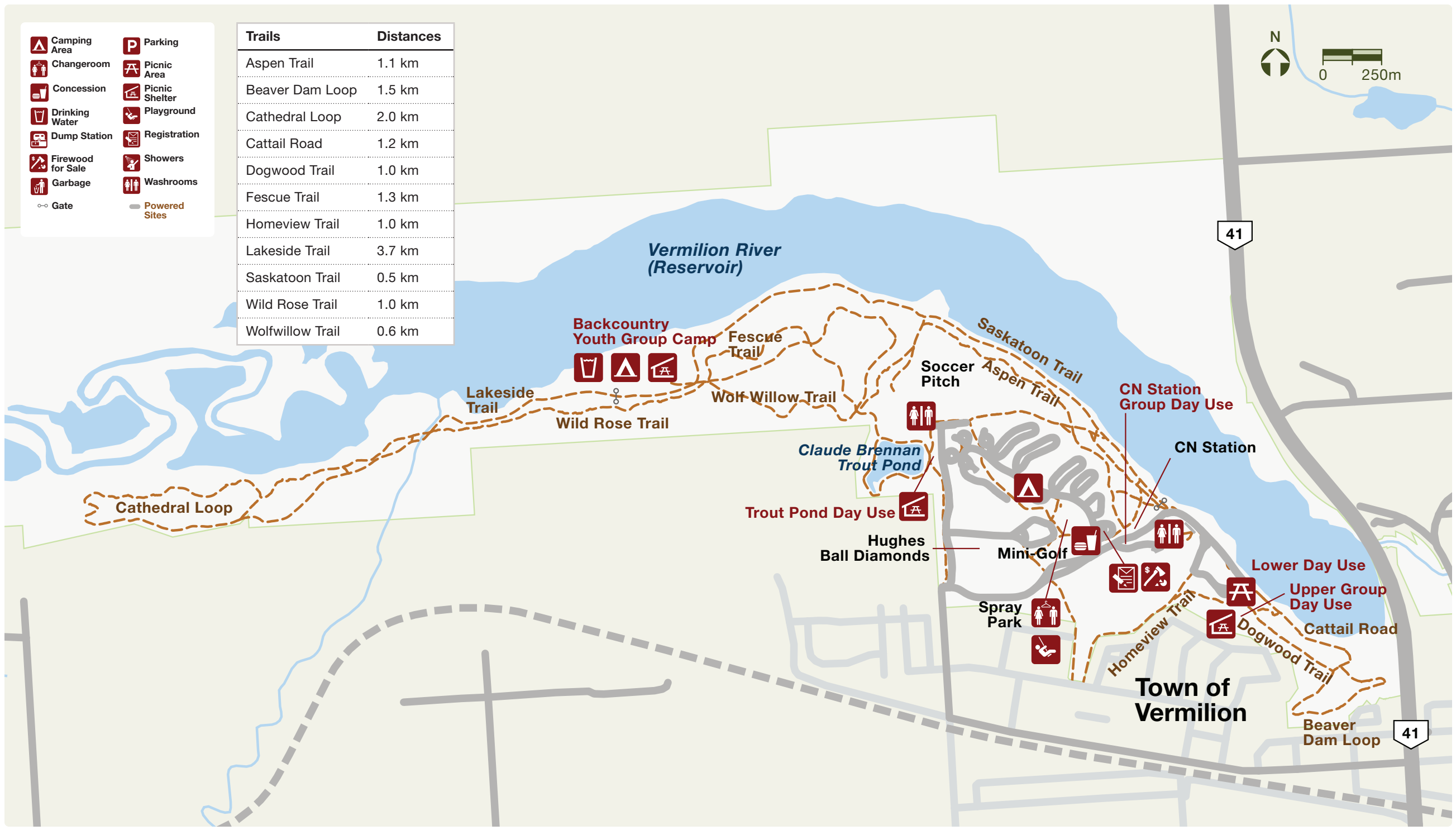
Vermilion trail map