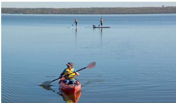
Kayaks and paddleboards

Rentals are available from Sir Winston Churchill Provincial Park Campground Store. All rentals come with safety equipment.