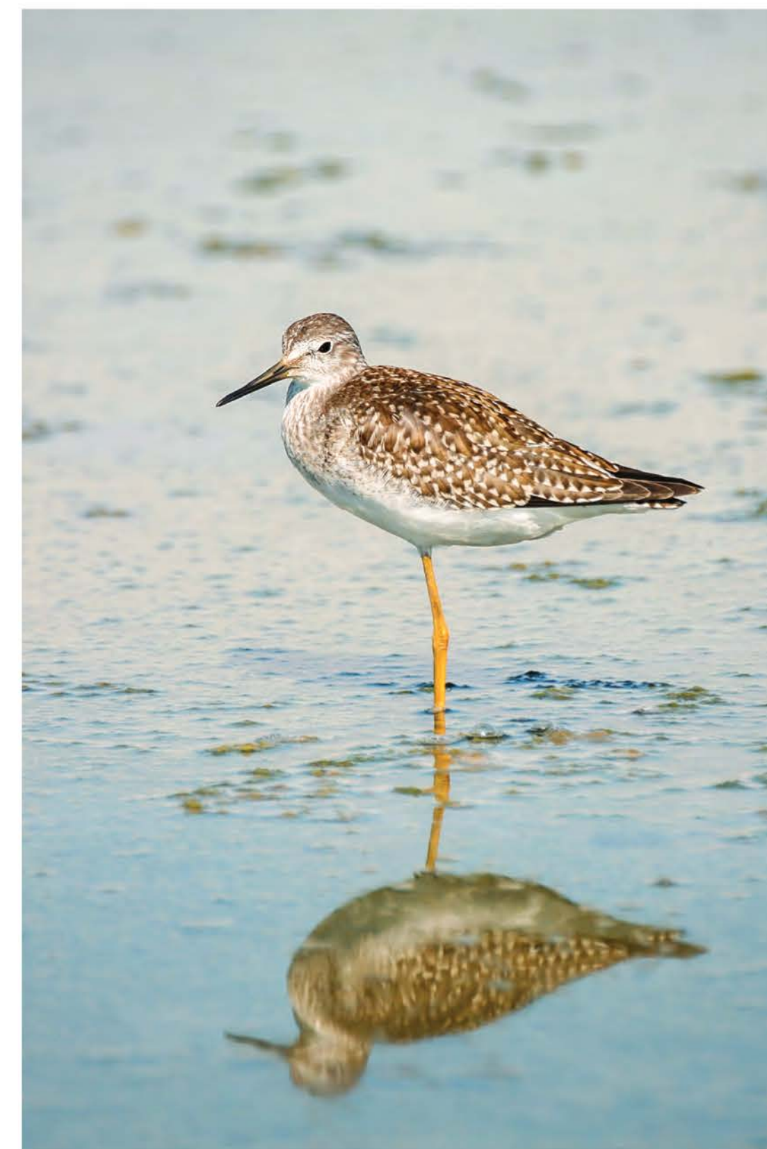
Lesser Yellowlegs

*See Lois Hole Centennial Provincial Park Special Protection Zone map