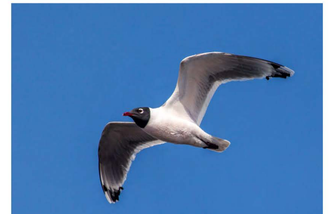
Franklin's Gull