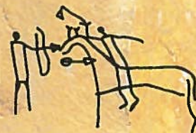
Mature Style Horse and Bison