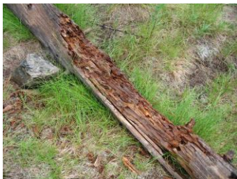
Bears tear at rotten logs looking for insects

Learn more about bear safety at www.wildsmart.ca