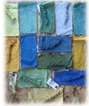
Yarns and fabrics dyed by Megan Samms.

You will need to find your own accommodations; there are hotels in the town of Slave Lake, private campgrounds outside the park, and provincial park campgrounds inside the park. See Appendix A for details.