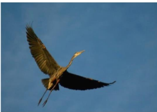
Great blue heron (A.Cole)