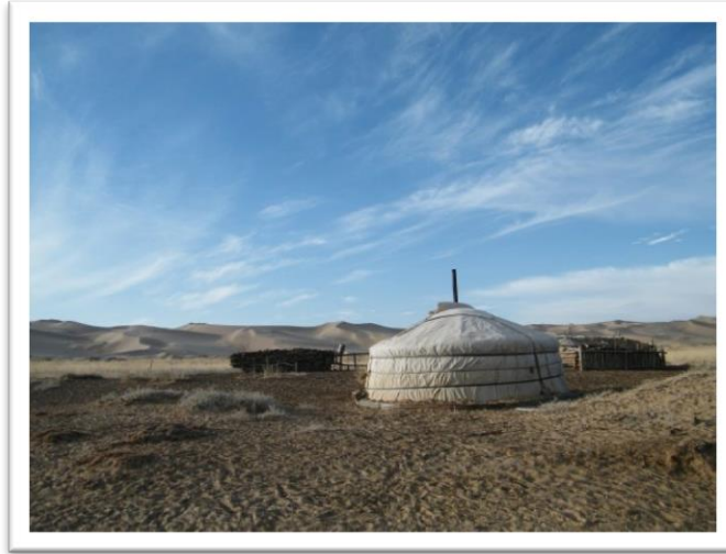
Yurt in Mongolia (Alex Mueller)

A yurt is the traditional dwelling of Central Asia nomads. Made to resist extreme climates, this circular shape abode has five basic elements: lattice walls, roof beams, a roof ring, a door, and a felt and hide covering. Since the 13th century, yurts have been used by nomadic horse herders as portable homes. It takes less than a day to deconstruct or set-up a yurt.