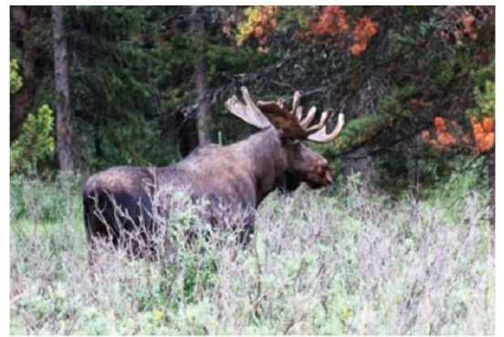
Bull moose (A.Cole)