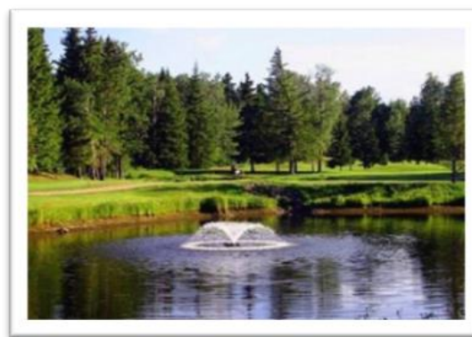
Black Bull Golf Resort