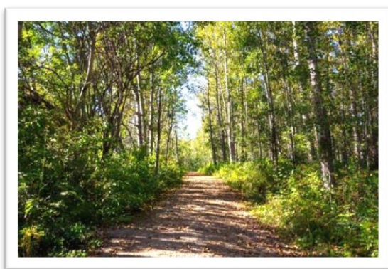
Pigeon Lake hiking trail

- Mini Golf and park for all ages. Beautifully landscaped, terraced greens, waterfalls. Gold Panning, Grass volleyball, Tetherball, Soccer, Sandbox, and Snacks also available. Located one block north of the Village at Pigeon Lake.