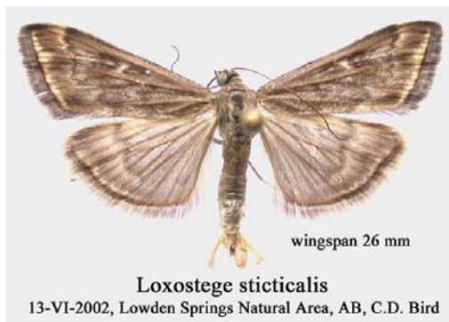
Plate 1. Some Moths of the Lowden Springs Natural Area.