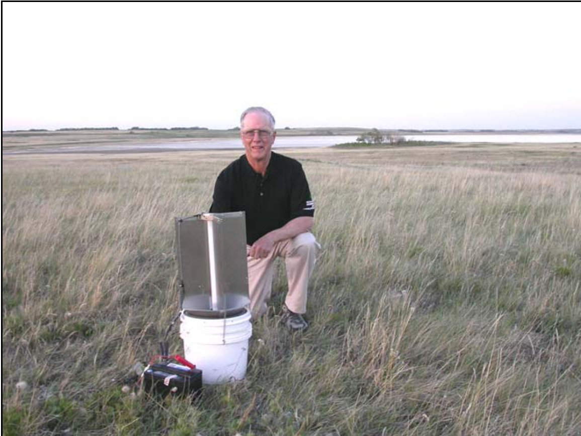
Native grasses, Prairie Crocus and Three-flowered Avens; Lowden Springs Conservation Area, looking ENE towards Lowden Lake, June 3, 2004.

Charles Durham Bird, 24 April 2007 Box 22, Erskine, AB, T0C 1G0 cdbird@xplornet.com