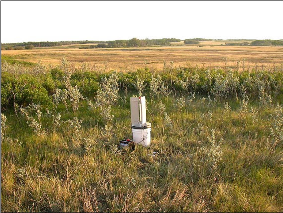
A stand of Silver Willow and Buckbrush in the middle of the Lowden Springs Natural Area, 4 June 2004

At the dedication, the writer was encouraged to carry out an inventory of the Lepidoptera of the area. He was especially interested in doing so as he was endeavoring to document the species found in natural areas in south-central Alberta and none of the other areas being researched had as much native grassland. The area was studied six times during 2002: June 13 and 20, July 2, 6 and 23; and August 23. On all occasions, 2 ultraviolet light traps were set up at dusk and removed the following morning. In 2003, the area was studied another six times: May 1 and 30, June 15, July 7, August 14 and September 5. In 2004, traps were set out on the nights of June 3, July 31 and August 11. In 2005, the area was studied on May 18, June 9, July 8 and August 5. In 2006, the area was sampled on the nights of May 15, June 28 and August 28.