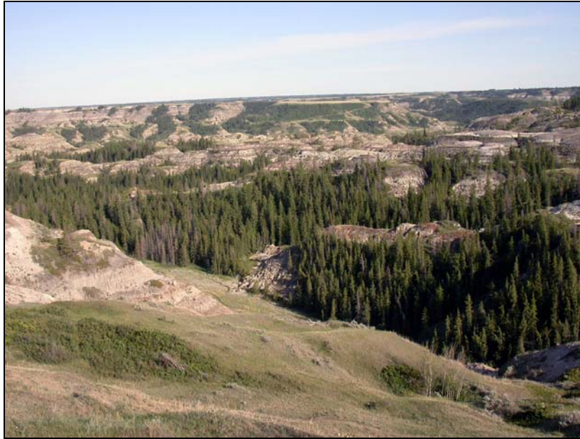
Looking ESE from the escarpment north of the “Dry Island”, June 19, 2004.

about two miles south of the main Park area (51.86, 113/01) and mainly on the escarpment on the east side of the Red Deer River valley. The area was studied 7 times in 2004: May 30, June 19, July 11 and 18, August 15 and 28, and September 24. In 2005: the area was studied 5 times: April 24, June 21, July 10, August 2 and 28.