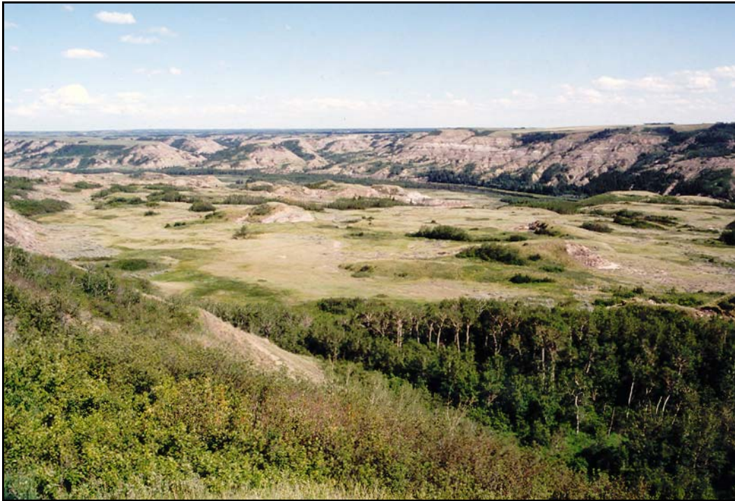
Dry Island Buffalo Jump Provincial Park looking east from the escarpment on July 8, 2001.

Dry Island Buffalo Jump Provincial Park, established in 1970, is located on the Red Deer River, 25 km northeast of Trochu. It is 15 km east of Highway 21. The area is so-named because of a flat-topped mesa, or “dry island” which rises some 200 metres above the river. On the west side of the Park, there is a precipitous cliff over which buffalo were stampeded by Indians. Ecologically, the Park is made up of badland terrain, grassy flats, shrub (saskatoon, chokecherry, silver willow, buckbrush) thickets, deciduous (aspens) woodland and riverine (balsam poplar) forest.