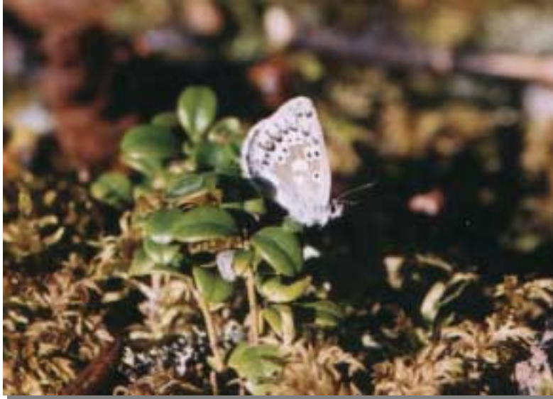
Figure 5. A. glandon lacustris sitting on Vaccinium vitis-idaea near the basecamp (Site 8).

Agriades glandon lacustris - A common subspecies that is restricted to rock outcrops of the Canadian Shield. This species is only found in the Kazan Uplands and in the Fort Vermillion regions of Alberta.