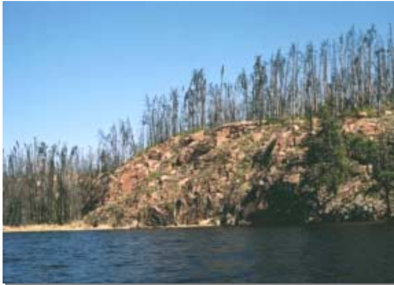
Figure 3. Rock outcrop at Woodman Lake.