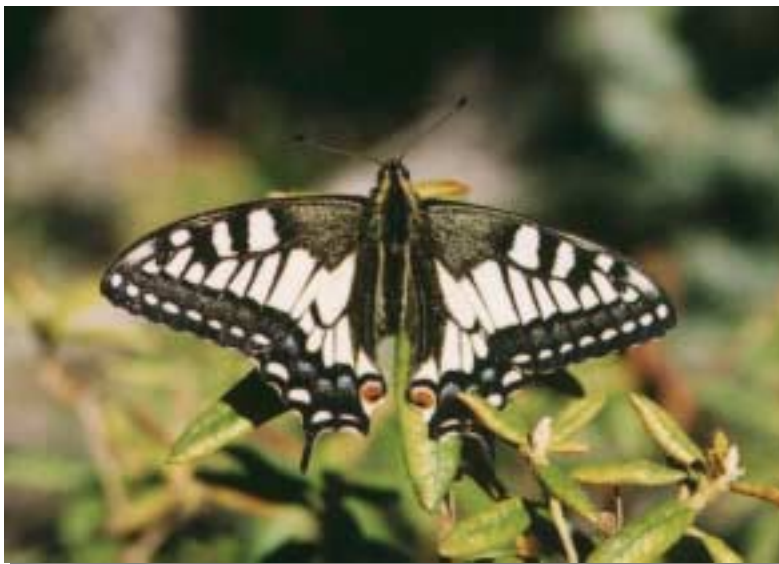
Figure 4. P. machaon sitting on Ledum groenlandicum near the basecamp (Site 8).

Papilio machaon hudsonianus - An uncommon species that exists in localized populations across the boreal forest. This specimen was found patrolling the sand esker 500 m northwest of camp (Site 12). This is the most northern record for Alberta though it exists in the NWT and Yukon.