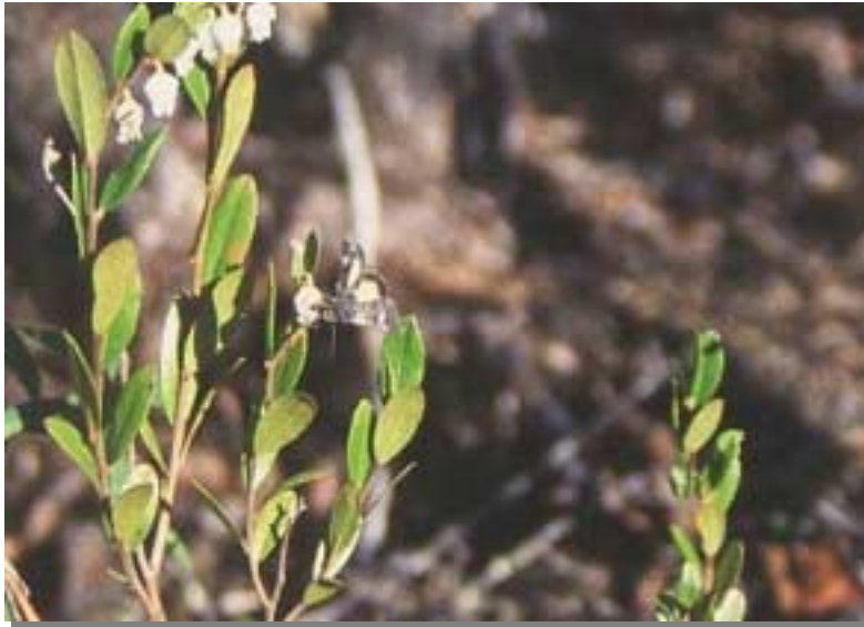
Figure 6. A. luteola nectaring on Chamaedaphne calyculata (Site 9).

Heliothis borealis - This is an uncommon species that occurs across the boreal forest. This record is a substantial range extension from the southern boreal. Specimens were collected nectaring at Arctostaphylos uva-ursi .