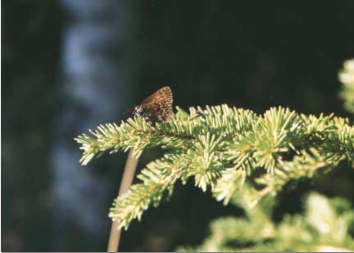
Figure 1. Callophrys eryphon eryphon sitting on Picea branch near camp.