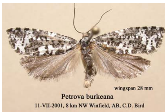
wingspan 28 mm Petrova burkeana 11-VII-2001, 8 km NW Winfield, AB, C.D. Bird