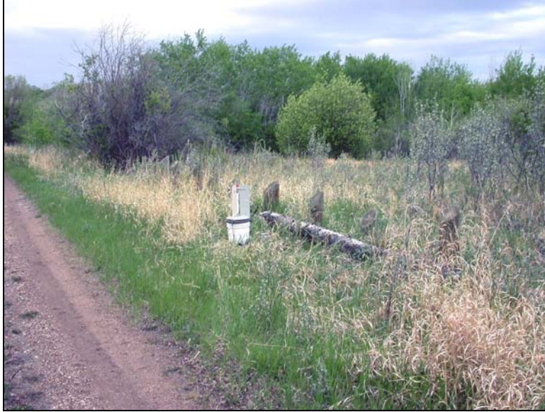
A UV trap set up among awnless brome, silver willow, willow and aspen, May 28, 2004.