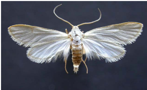
Acentria ephemerella , wingspan 14 mm: ALBERTA, Big Knife Provincial Park, 11-IX-2002, C.D. Bird, BIRD45