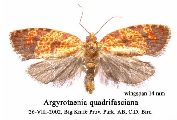
wingspan 14 mm Argyrotaenia quadrifasciana 26-VIII-2002, Big Knife Prov. Park, AB, C.D. Bird