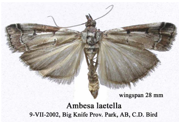
wingspan 28 mm Ambesa laetella 9-VII-2002, Big Knife Prov. Park, AB, C.D. Bird