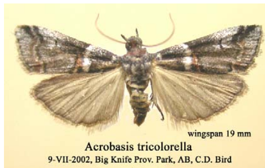
wingspan 19 mm Acrobasis tricolorella 9-VII-2002, Big Knife Prov. Park, AB, C.D. Bird