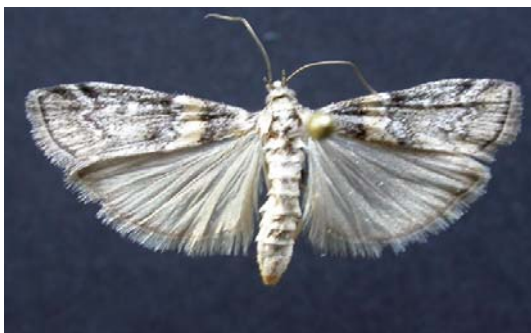
Dioryctria pseudotsugella , wingspan 22 mm: ALBERTA, Big Knife Provincial Park, C.D. Bird, BIRD222