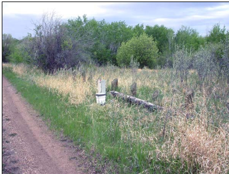
A UV trap set up among awnless brome, silver willow, willow and aspen, May 28, 2004.