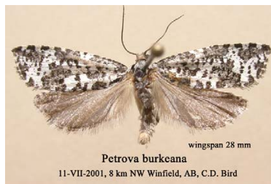
wingspan 28 mm Petrova burkeana 11-VII-2001, 8 km NW Winfield, AB, C.D. Bird