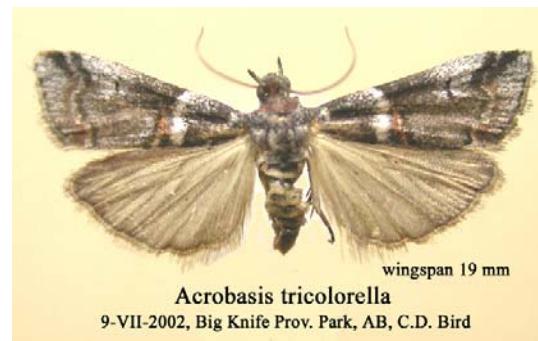
wingspan 19 mm Acrobasis tricolorella 9-VII-2002, Big Knife Prov. Park, AB, C.D. Bird