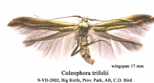
wingspan 17 mm Coleophora trifolii 9-VII-2002, Big Knife, Prov. Park, AB, C.D. Bird