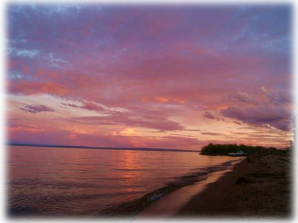
A Lesser Slave Lake Provincial Park sunset.

Located on the northeastern shore of Lesser Slave Lake, Lesser Slave Lake Provincial Park (LSLPP) protects an unusual sand dune and wetland complex as well as representative examples of the boreal forest and foothills natural regions. Trails, campgrounds, lakes and 7 km of natural sand beach provide a variety of recreational opportunities to visitors, including hiking, birdwatching, mountain biking, swimming, sunbathing, fishing, paddling, kitesurfing, and, of course, camping.