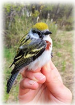
A chestnut-sided warbler banded at the LSLBO.

Special mention must be made of the Lesser Slave Lake Bird Observatory (LSLBO), a hub for monitoring bird migration within LSLPP. This facility is operated by a non-profit organization and is part of the Canadian Migration Monitoring Network. Since the LSLBO was established in 1993, they have recorded over 250 species of birds within LSLPP and banded nearly 75,000 birds. Migration data collected by the LSLBO contributes to our understanding of migration routes, bird lifespans, and bird population trends.