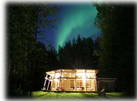
The Nest Comfort Camping.

The Nest is a peaceful, sun-washed timber-frame building located next to the Boreal Centre for Bird Conservation within beautiful Lesser Slave Lake Provincial Park. The Nest has room for 10 guests with four bunk-bed rooms and two queen-bed rooms. In addition, it has two washrooms with showers and a large common room with full kitchen facilities and fireplace. Outside is a large deck with barbeque, firepit and picnic table.