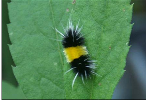
Lophocampa maculata caterpillar, Medicine Lake, 1 Aug 2002.