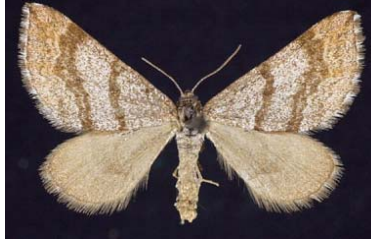
Carsia sororiata , from Geometridae of Canada web site.