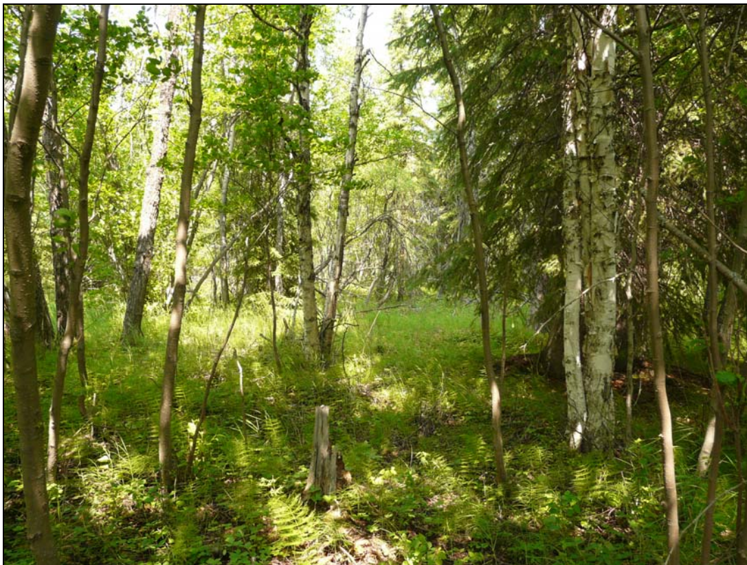
Wet woods beside Medicine Lake with White Birch, 12 Jul 2009.