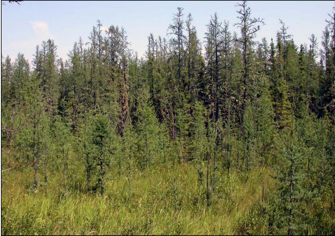
Medicine Lake, 6 Aug 2003. Tamarack/Black Spruce/Labrador Tea/Big Birch/Sphagnum bog.