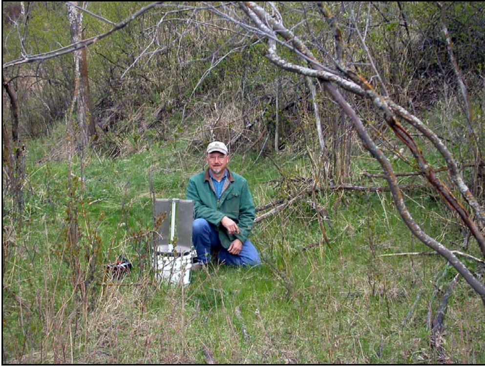
Art Bird beside moth trap in coulee bottom, 9 May 2005