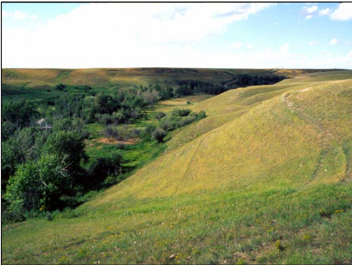
East Arrowwood Coulee looking north, August 17, 1997

The present paper incorporates the information in previous reports along with that gathered in 2008. It also includes a number of redeterminations and additions to the information in the earlier reports.