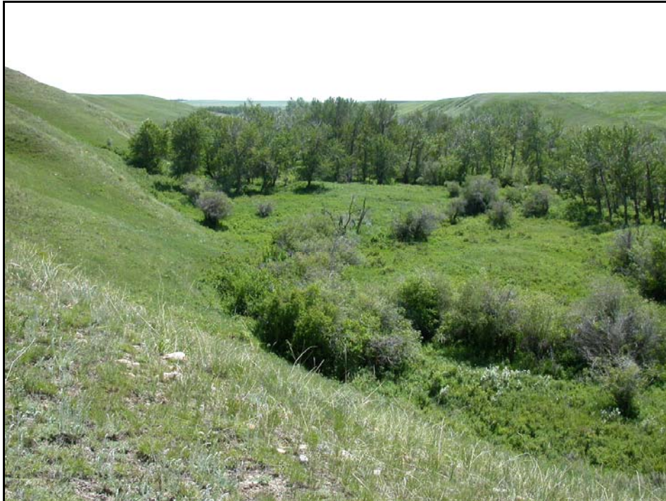
East Arrowwood Coulee looking south, June 26, 2004

A number of sightings were made on July 24, 1997. The area was sampled with ultraviolet light traps on the nights of August 3, 2000; June 2, 2001; June 27, 2003; and April 11 and June 26 in 2004. In 2005, the area was studied on May 8 and on July 2 and 30. Collections were made on June 17 and July 29, in 2006. In 2007, collection were made on March 10, April 28, June 1 and September 2. The present report contains the results of work done in 2007 and in the previous years (Bird 2004, 2005, 2006, 2007).