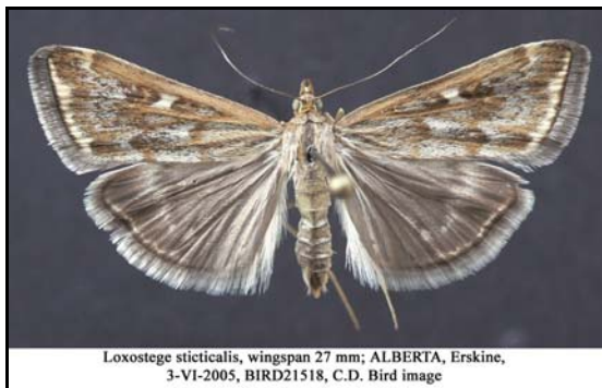
Loxostege sticticalis , wingspan 27 mm; ALBERTA, Erskine, 3-VI-2005, BIRD21518, C.D. Bird image

4957. Mutuuraia mysippusalis (Wlk.) – 27B-VI-2003 1.