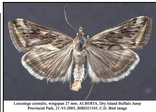
Loxostege cereralis , wingspan 27 mm; ALBERTA, Dry Island Buffalo Jump Provincial Park, 21-VI-2005, BIRD21545