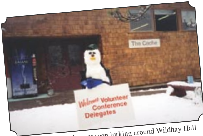
Unregistered participant seen lurking around Wildhay Hall