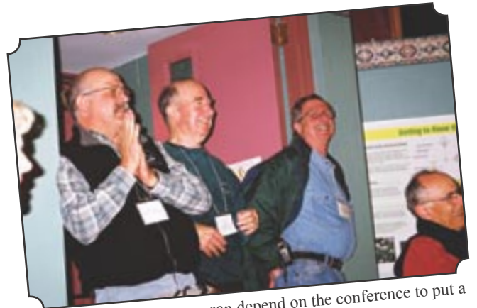
Despite the weather, you can depend on the conference to put a smile on your face