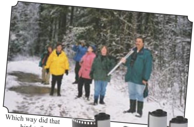
Which way did that bird go?