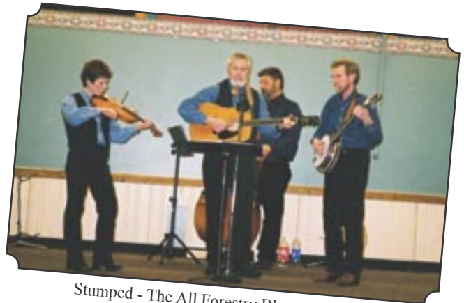
Stumped - The All Forestry Bluegrass Band