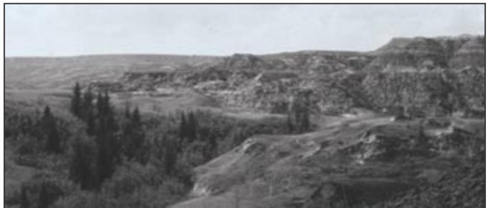
"Many people have no idea that such a place exists"

I hope to be able to lead people hiking for a few years yet, to share the beauty of the area with others.