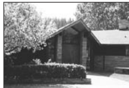
Fish Creek Environmental Learning Centre

This past winter, a series of slide shows on parks and protected areas was launched. Many of the presenters volunteered their time to deliver these important messages about Alberta's special places.