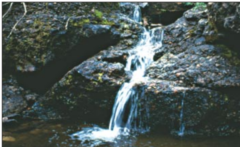
Not just a pretty cascading stream - a sustainer of life

According to Environment Canada, of the world's total water supply only 2.5 percent is fresh and two-thirds of that amount exists in the form of ice caps and glaciers. Currently about 40% of the world's population, more than two billion people, face water shortages. Given the present human population growth rate, the UN predicts that by 2025 two-thirds of the world's population, some 5.5 billion people, will not have adequate water.