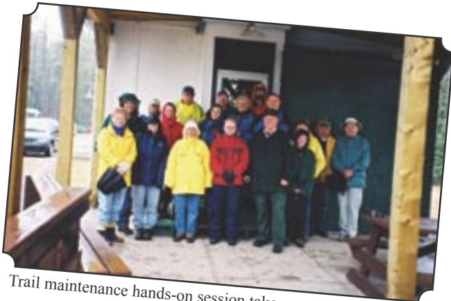
Trail maintenance hands-on session takes cover for a photo op