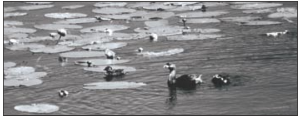
Here in Canada many of us take our water for granted

Alberta Parks and Protected Areas is one of many partners that represent Alberta. There are celebrations being planned in several of our sites around the province. An up to date listing of events and activities being planned across Alberta and Canada can be found at www.wonderofwater.ca . Check out this fast-growing web site for information about the celebrations, the partners involved and how you can get involved.