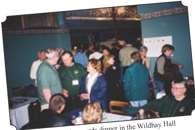
Saturday night awards dinner in the Wildhay Hall