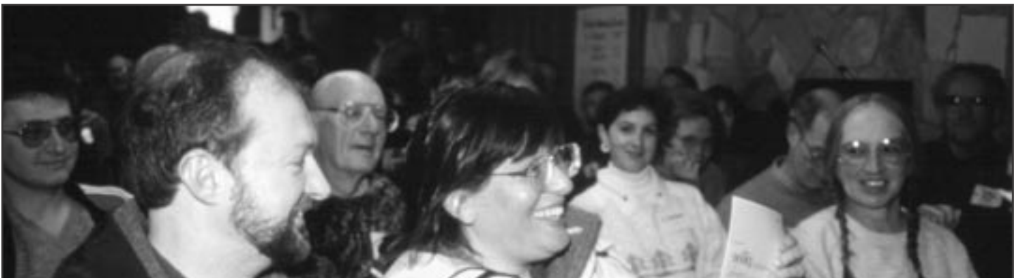
Volunteers from across Alberta enjoying a session at the first Volunteer Steward Conference in 1990