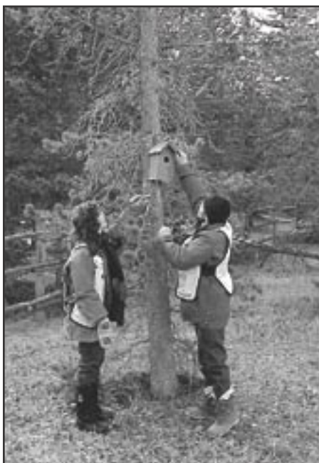
Aaron and Elise checking a newly found birdhouse

In order to document the location and determine use of bird boxes throughout the park, volunteer stewards will be mapping the location of all the boxes in the park, cleaning and fixing them, and monitoring use through spring and early summer. This is no easy task, first we have to find them! Coordinating these efforts will be volunteers Aaron and Elise Bowersock.