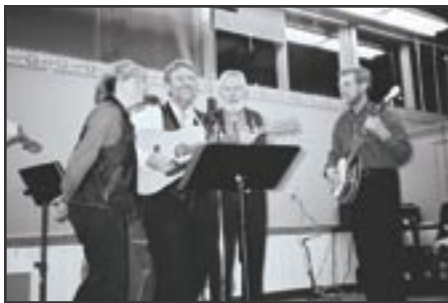
Stumped - taking the chill off

The 2003 Volunteer Conference was held April 25 – 27 at Blue Lake Adventure Lodge in William A. Switzer Provincial Park. The lodge, nestled in the snow-capped Rocky Mountains near Hinton, was an ideal setting. Accommodations and meals were provided all within easy walking distance of conference venues.